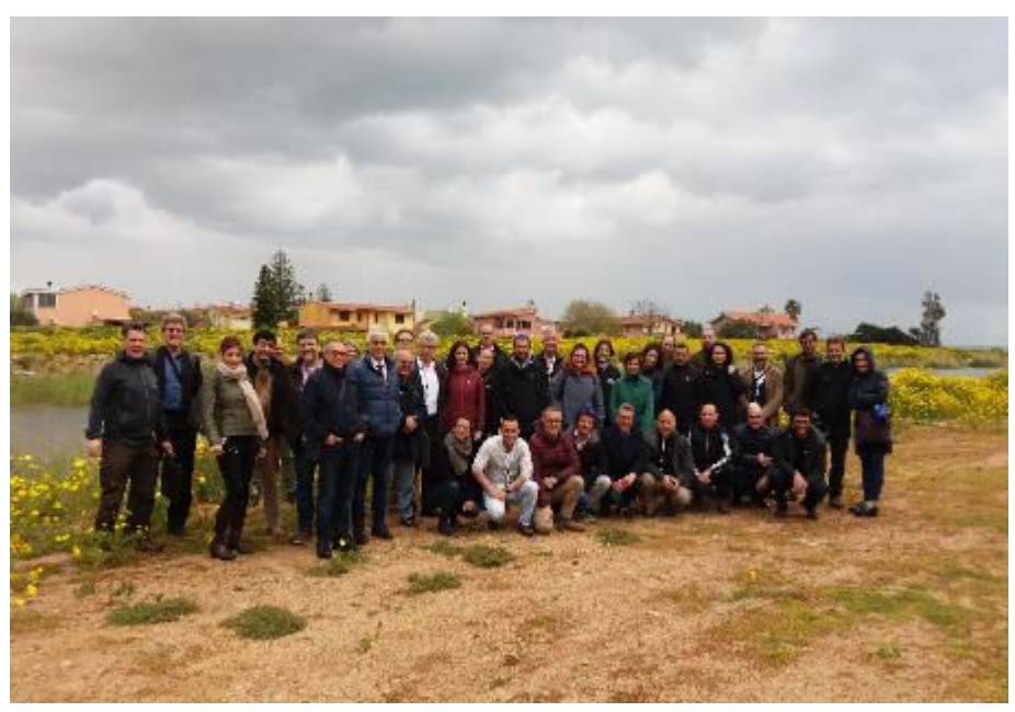
Attendance family picture in Capoterra

Thanks to the Municipality, to the Municipality Mayor, to Arpas, the Regional Meteo Department the University of Cagliari and to the representative of the Regione Sardegna Department for Public Works for their collaboration and support!