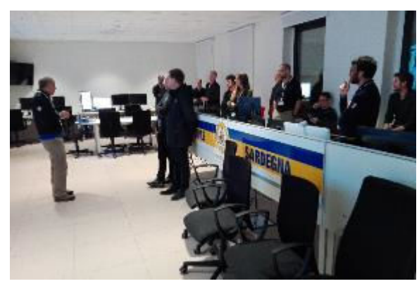
Visit to the DG PC RAS Headquarter