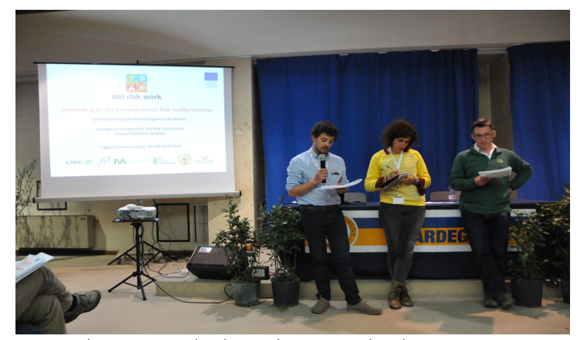
The report-out by the workgroups to the plenary session