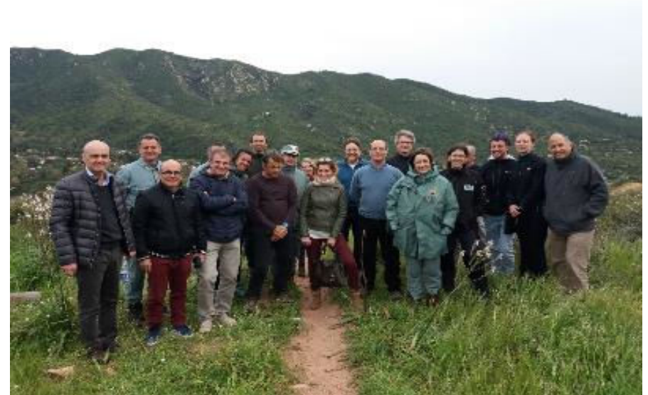
Attendance family picture in Villaggio delle Mimose, Sìnnai