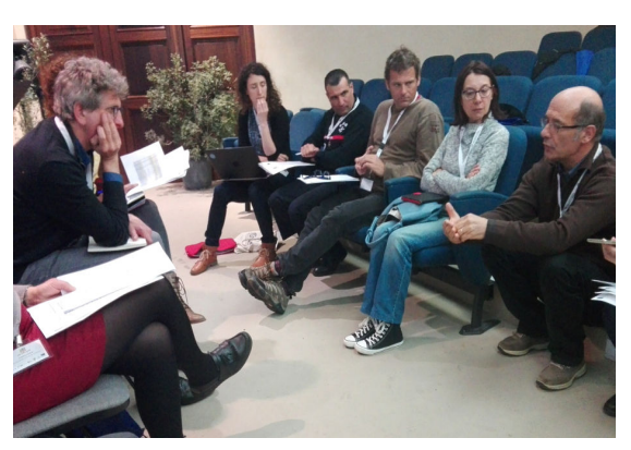
Participants were divided in 3 different discussions groups, spaces to discuss and reflect on the specific workshops thematic.