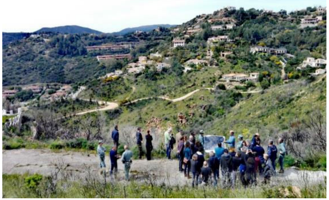
By the hand of an expert forestry technician, was illustrated the wildfire case studies of Capo Blu, Eden Rock (2016) and Burranca, Villaggio dei Gigli (2014)

Thanks for contributing to the Municipality Mayor, Forest Ranger Service and Environmental Surveillance - Sardinia Region, representative of Forestas - the Regional Forestry Agency!